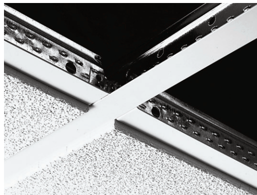
Prelude XL suspension system

SUSTAIN™ High Performance Sustainable Ceiling Systems